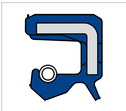
Simmerring BA ...SL