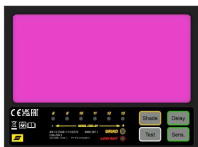
New multi-color LED display